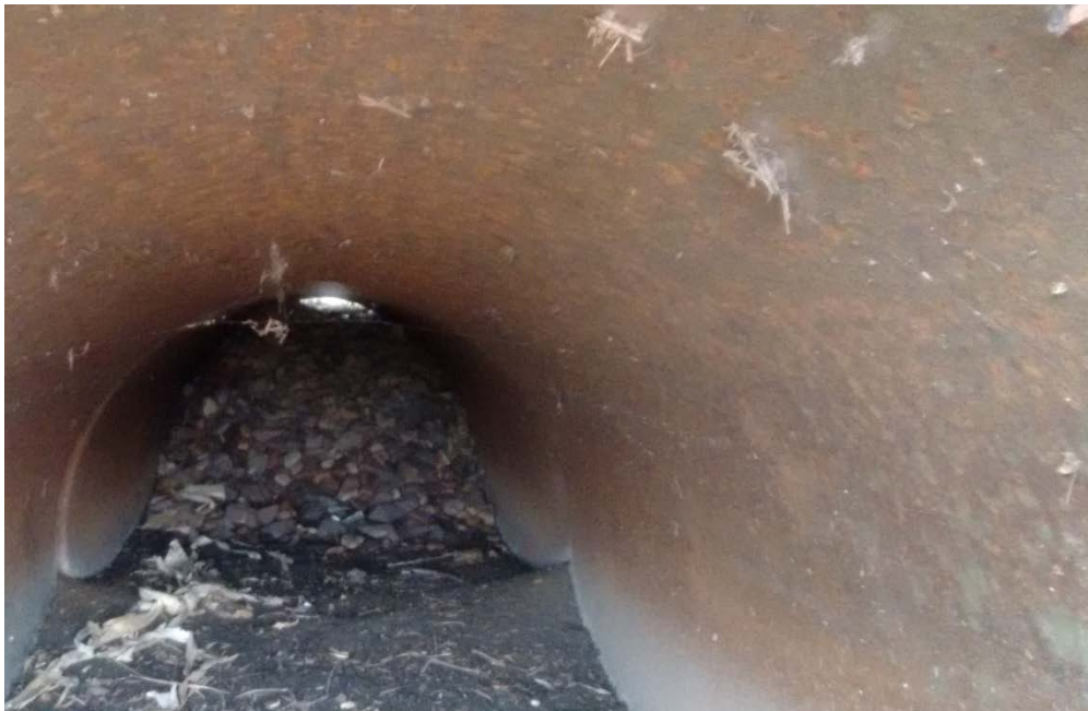
1 inch thick culvert under Railroad, Highway 10, D4.