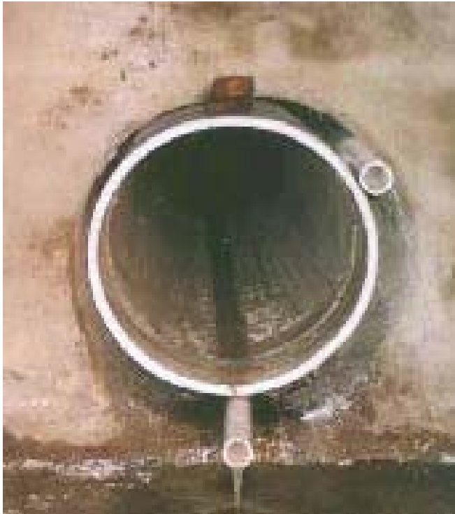
Photo of PVC liner from Caltrans

http://www.dot.ca.gov/hq/oppd/dib/dib83.pdf