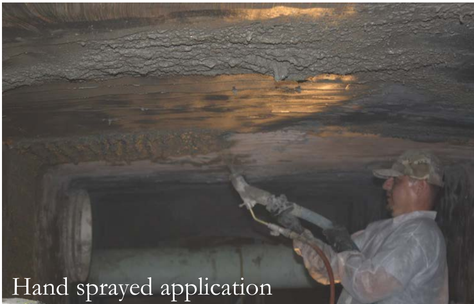
Hand sprayed application