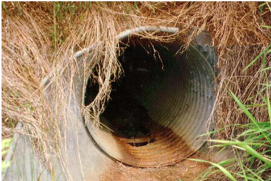
Zinc-galvanized steel pipe