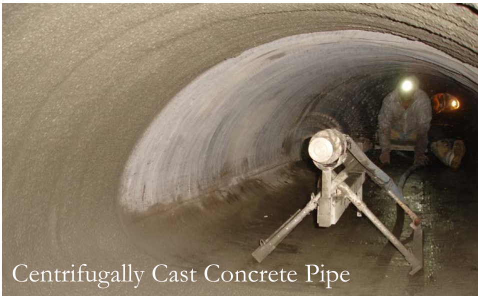
Centrifugally Cast Concrete Pipe