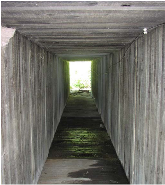
Wooden cattle pass in D6 on MN 60 r.p. 185.91