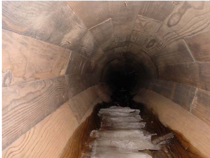
Wooden Pipe on Grand Ave, MN 23 in Duluth